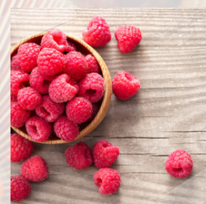
RASPBERRIES $3.50 PER PUNNET