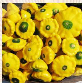
YELLOW SQUASH $18 PER BOX