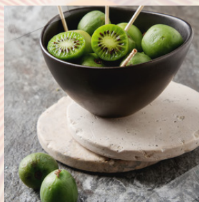
KIWIBERRIES $3 PER PUNNET