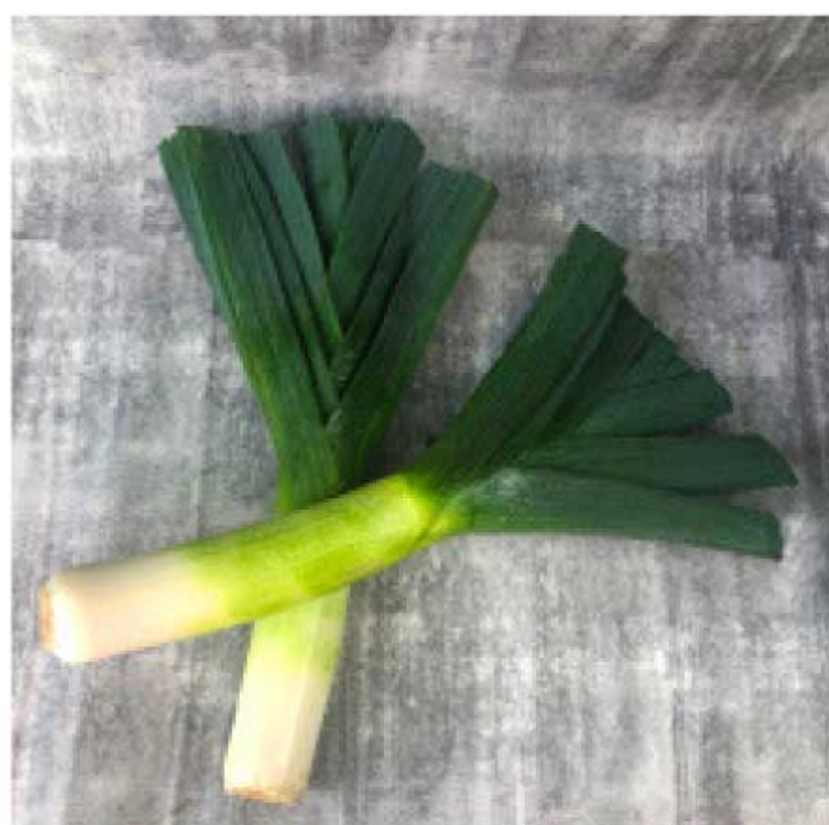
LOCAL LEEKS $18 PER BOX