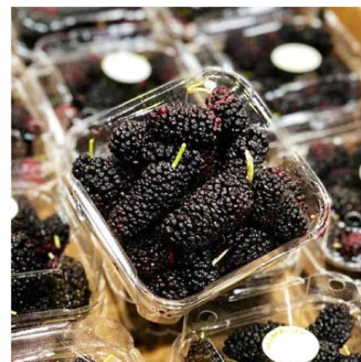
LOCAL MULBERRIES $4 PUNNET