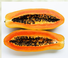
RED PAPAYA $15 PER TRAY