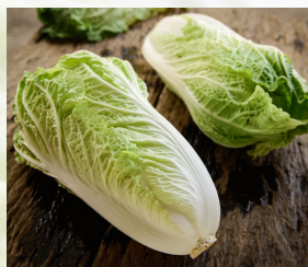
WOMBOK CHINESE CABBAGE $18 PER BOX