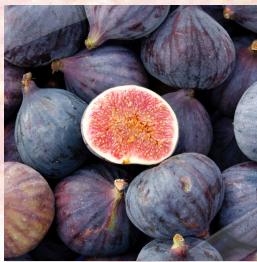
LOCAL FIGS $24 PER TRAY