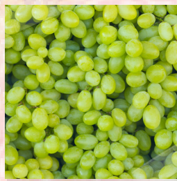
AUSTRALIAN GREEN GRAPES $36 PER BOX