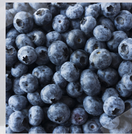
BLUEBERRIES $2 PER PUNNET