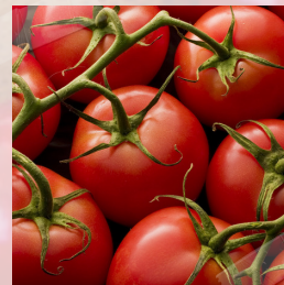
VINE RIPE TOMATOES $18 PER TRAY