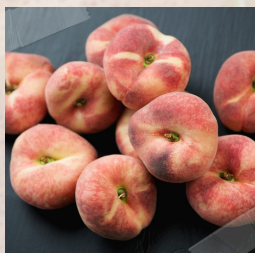
DONUT PEACHES $18 PER TRAY