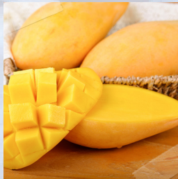
MANGOES $18 PER BOX