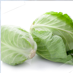
SUGAR LOAF CABBAGE $2 EACH