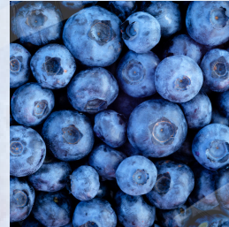
BLUEBERRIES $2 PER PUNNET