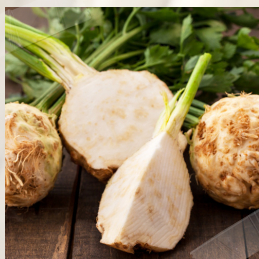
CELERIAC $3 HEAD (LARGE SIZE)