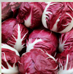
LOCAL RADICCHIO $15 PER BOX