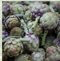
BABY GLOBE ARTICHOKE $18 PER BOX