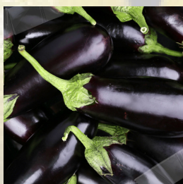
EGGPLANT $15 PER BOX