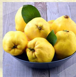
QUINCE $20 PER BOX