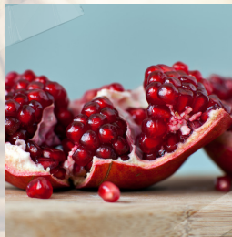
AUSTRALIAN POMEGRANATE $18 PER TRAY