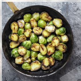
BRUSSEL SPROUTS $18 PER BOX