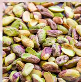
FRESH PISTACHIOS $10 PER KILO