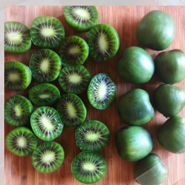
KIWI BERRIES $3 PER PUNNET