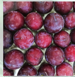
BLOOD PLUMS $18 PER BOX (5KG)