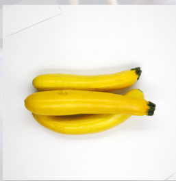
YELLOW ZUCCHINI $18 PER BOX (5KG)