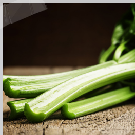
CELERY $18 PER BOX