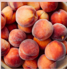
PEACHES $15 PER TRAY