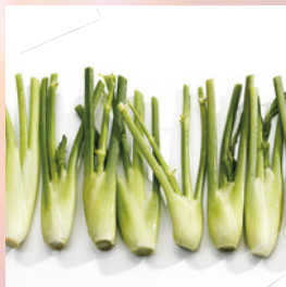
BABY FENNEL $15 PER BOX