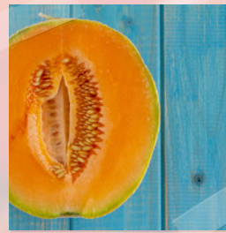
ROCKMELON $15 PER BOX