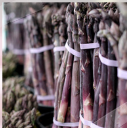
PURPLE ASPARAGUS $1.50 PER BUNCH