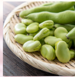
BROAD BEANS $18 PER BOX