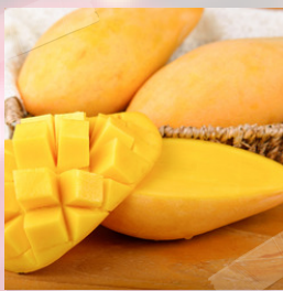
AUSTRALIAN MANGOES $24 TRAY