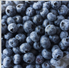
BLUEBERRIES $3 PER PUNNET