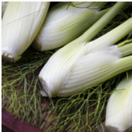
BABY FENNEL $12 PER BOX