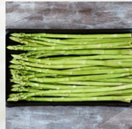
PREMIUM AUSTRALIAN ASPARAGUS $28 PER BOX (6KG)