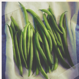
BEANS $25 PER BOX (10KG)