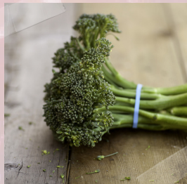
BROCCOLINI $15 PER BOX