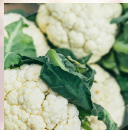
CAULIFLOWER $15 PER BOX