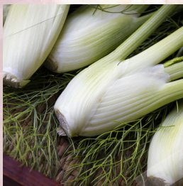
BABY FENNEL $15 PER BOX