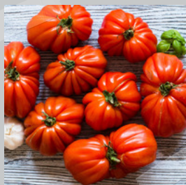
OX-HEART TOMATOES $36 PER BOX (4.5KG)