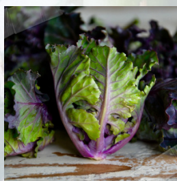
KALETTES $18 PER BOX