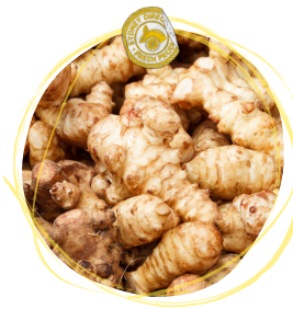
JERUSALEM ARTICHOKE $35 PER BOX