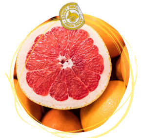
RUBY GRAPEFRUIT $18 PER BOX