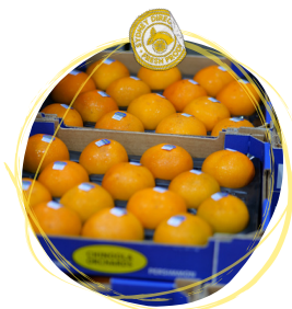
PERSIMMON $18 PER TRAY