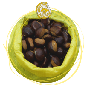
FRESH CHESTNUTS $5 PER KG