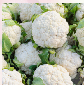
CAULIFLOWER $24 PER BOX