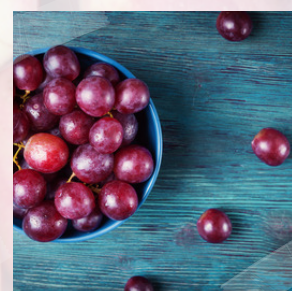
RED GRAPES $30 PER BOX