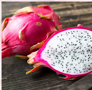
DRAGON FRUIT $15 PER BOX