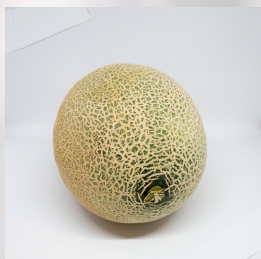
QLD ROCKMELON $15 PER BOX