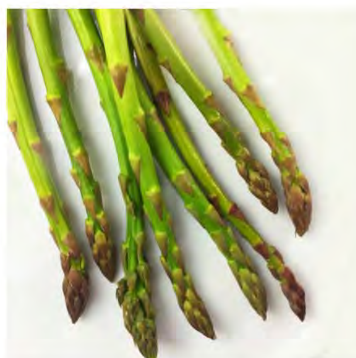
LOCAL LOOSE COMPOSITE ASPARAGUS $18 PER 5KG BOX