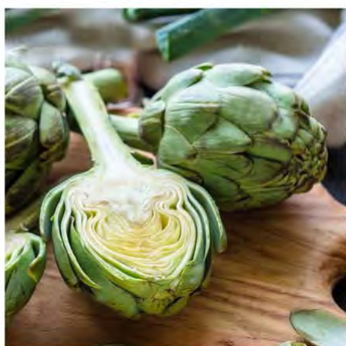
LOCAL GLOBE ARTICHOKE $12 BOX (SIZE 12)