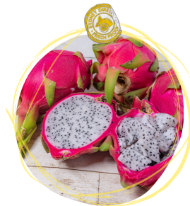
WHITE DRAGON FRUIT $18 PER TRAY