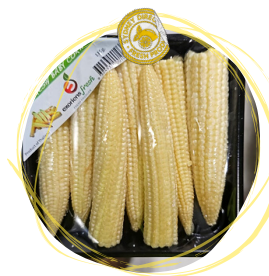
BABY CORN LOCAL $2 PER PUNNET