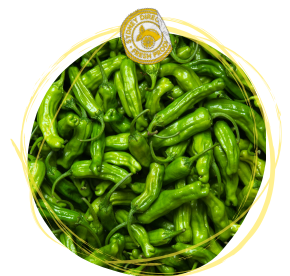
SHISHITO PEPPERS $18 PER KG