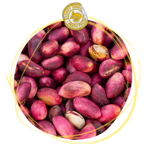
FRESH PISTACHIOS $18 PER KG